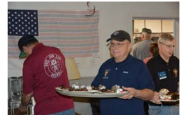
Serving steak lunches to veterans at the Plymouth-Ann Arbor Elks