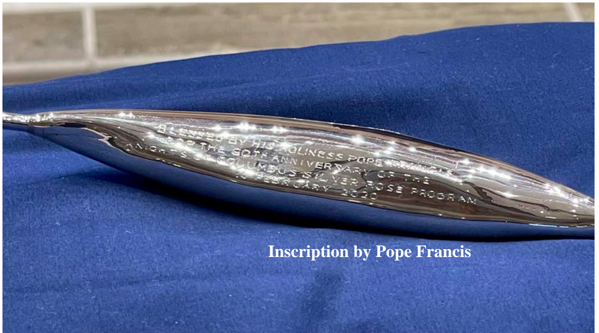
Inscription by Pope Francis