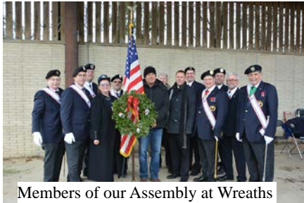
Members of our Assembly at Wreaths Across America

That's a couple of great questions! Perhaps at a Corporate Communion you've seen us wearing the berets and saluting with those swords... Perhaps you've seen us stand guard at the funeral for a fellow Sir Knight