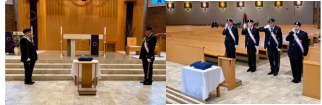
Presentation by Pope John XXIII Assembly