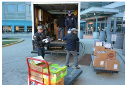
Delivering snack and drinks to the John D. Dingell VA Medical Center in Detroit

We have the honor of participating in Wreaths Across America ceremonies, where we honor those that served in our armed forces and are now passed away. We also have the honor