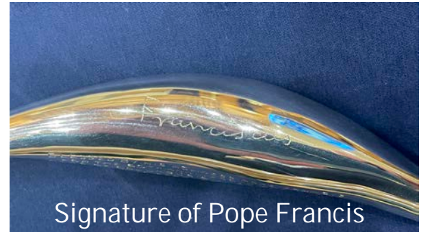
Signature of Pope Francis