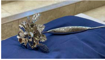
The silver Rose