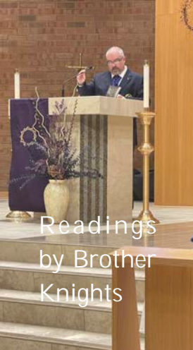
Readings by Brother Knights